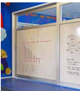
Overtaking with Whiteboard infill