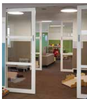
Bi-Parting 3-Lite powder coated