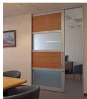
Single 4-Lite with custom infill