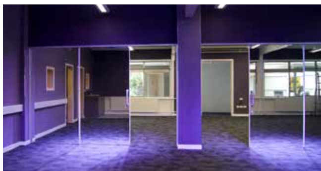
AluSealed Cavity Sliders with MirrorLite doors joined using the CS Actalink system