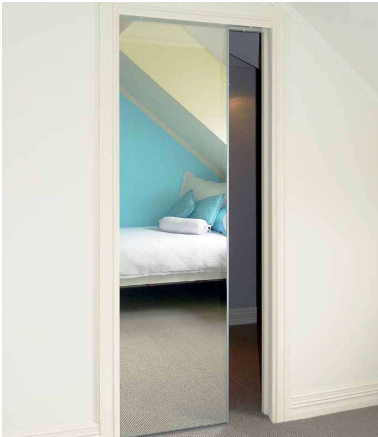
Cavity slider with MirrorLite door