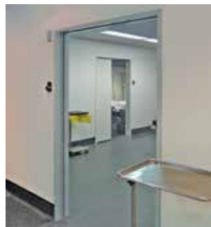
AutoCav with High Impact Jambs