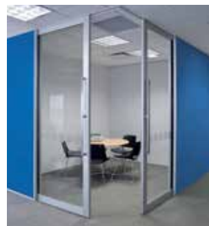
CornerMeeting AluSealed with NewYorker doors