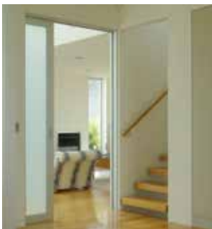
AluSealed cavity slider with NewYorker door