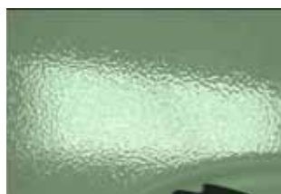
↑ A close up example of 'orange peel look'