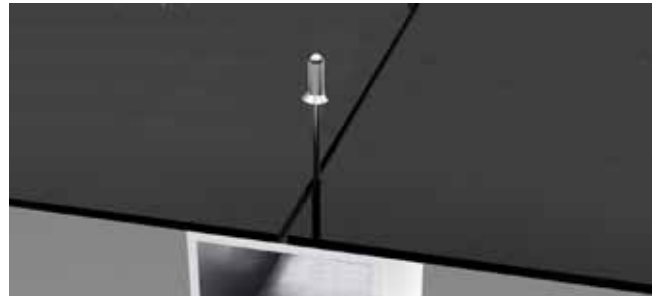
↑ Sheets are joined with a gap of 1.5mm (approx. 1 rivet stem) running vertically up the door. The gap is finished to a colour that best matches the sheet colour.

Any door requested over 6000mm x 2000mm will require a join due to the maximum size of sheet that we can supply. A CAD drawing will be supplied for any door over this size for customer sign off as a part of order acceptance.