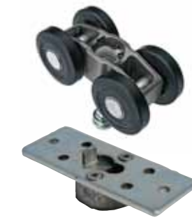
↑ M8 Carriage, mount plate and mount plate with stop (suits doors 90-240kg or more than 1500mm wide).