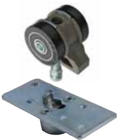
↑ M6 Carriage, mount plate and mount plate with stop (suits doors up to 90kg or up to 1500mm wide).