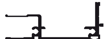
TimberFormed Split Jamb