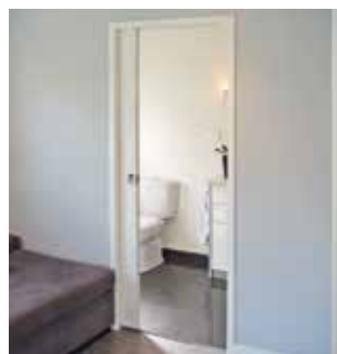
Single with flush door