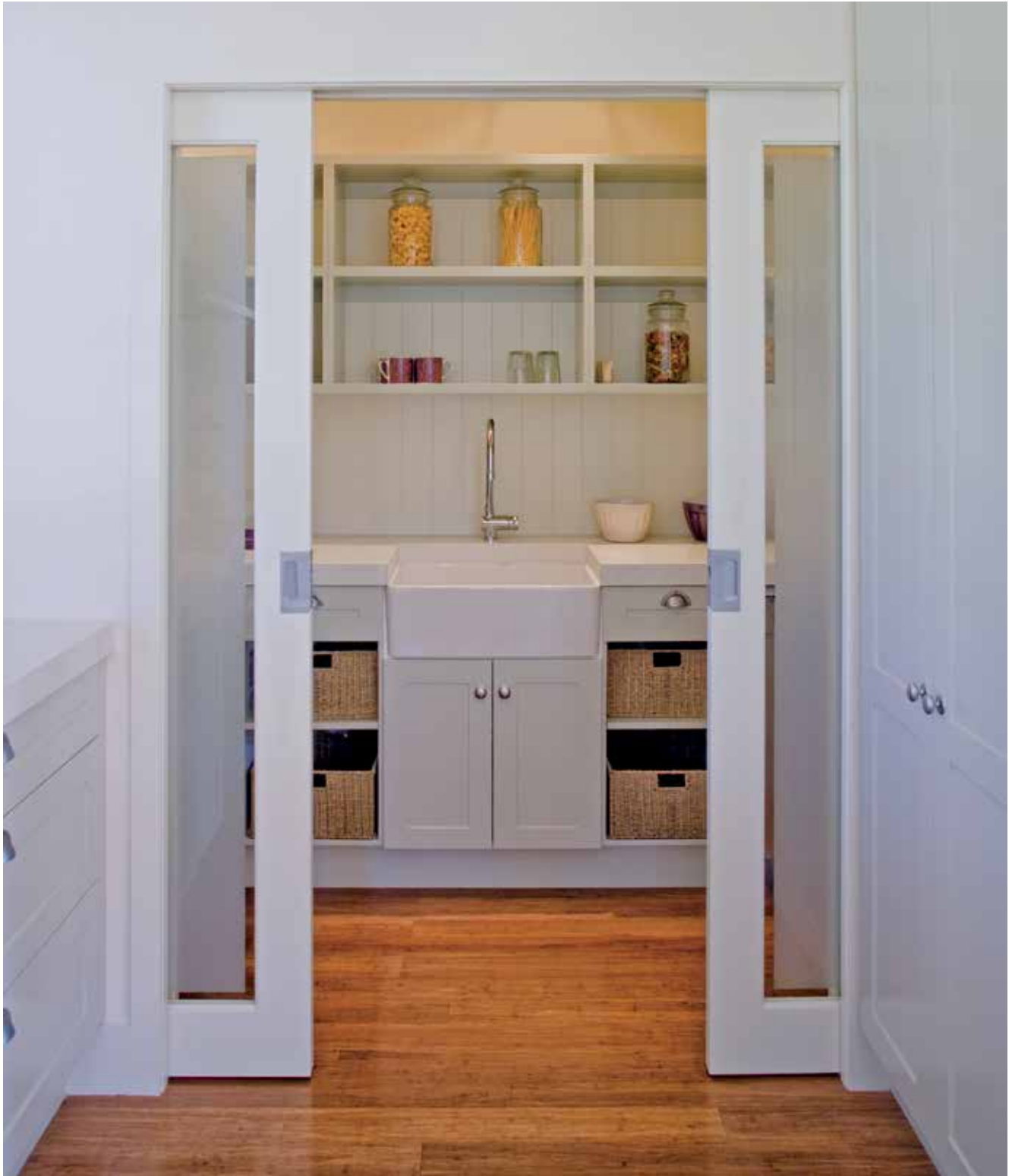
Bi-Parting CS SpaceMaker with glazed doors