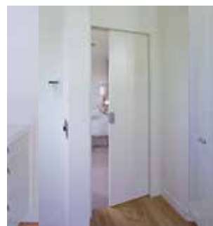
Single with grooved door