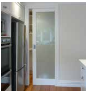
Single with glazed door