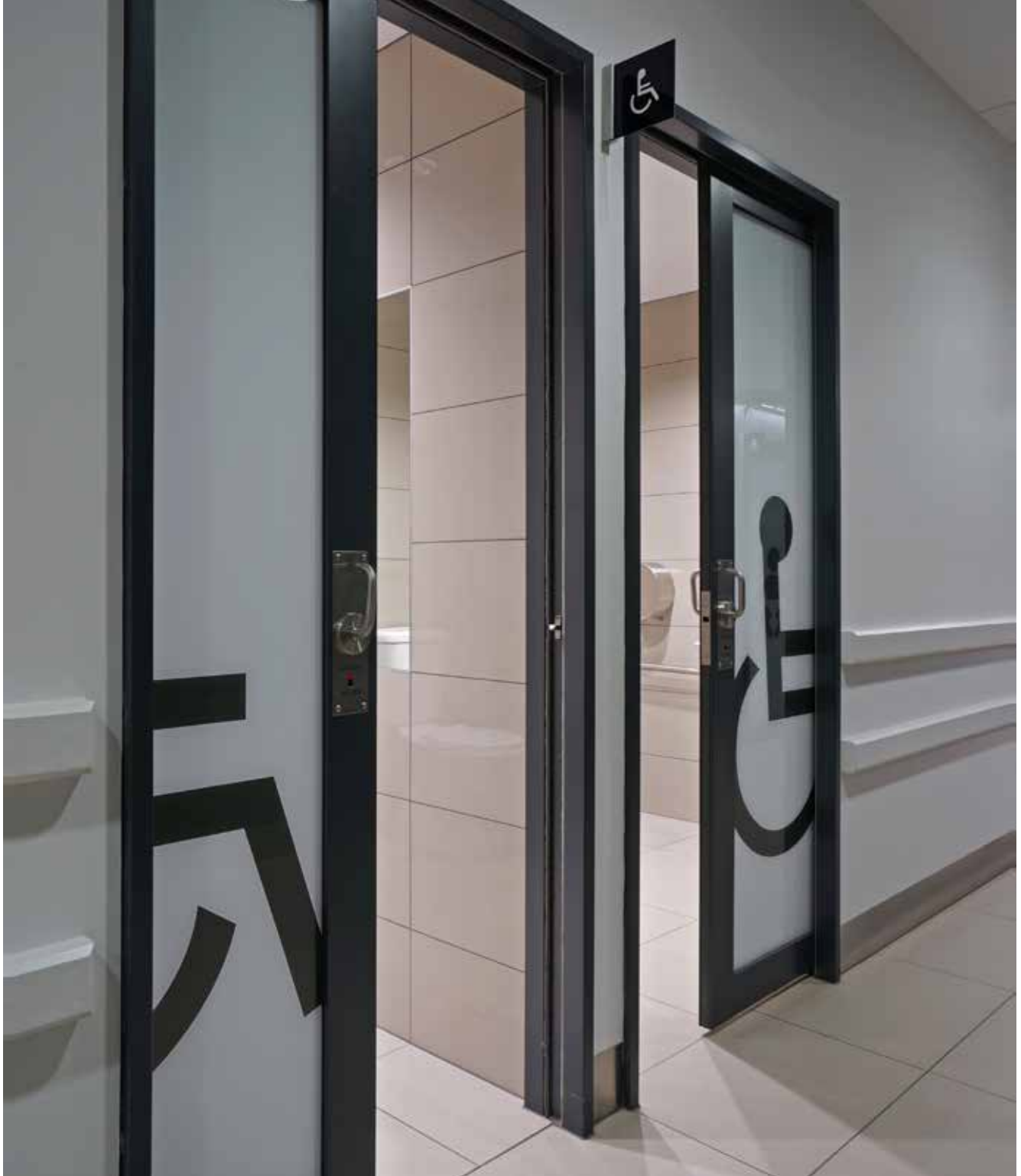
CS EasyOpen with NewYorker door and LaviLock