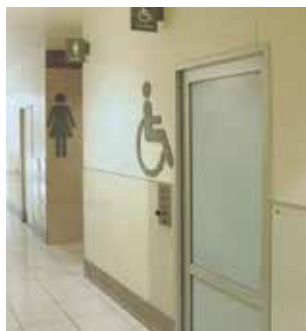
AutoCav WC with NewYorker