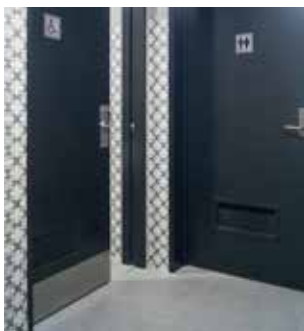
EasyOpen with flush door