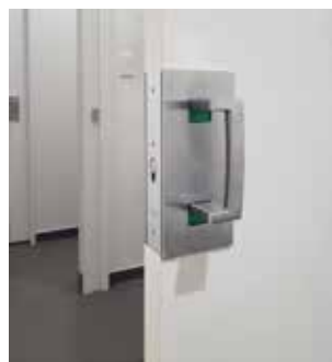
EasyOpen with CL400 ADA