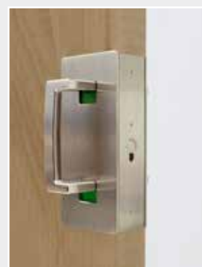
CL400® ADA Magnetic

Available in Satin Chrome or Polished Brass