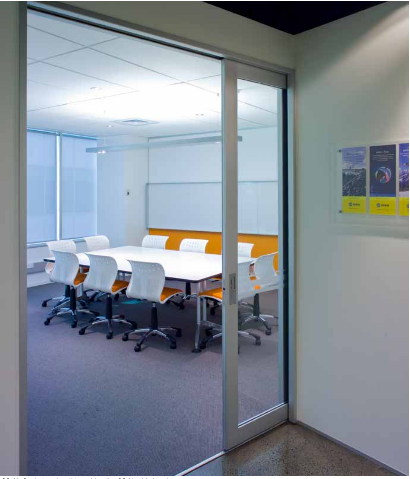
CS AluSealed cavity slider with 1-lite CS NewYorker door