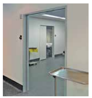
AutoCav with High Impact Jambs