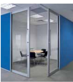
CornerMeeting AluSealed with NewYorker doors