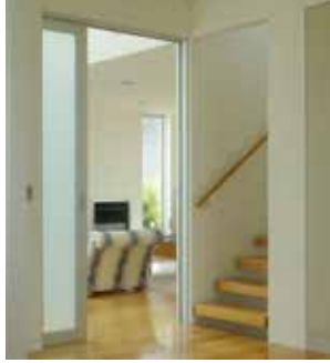
AluSealed cavity slider with NewYorker door